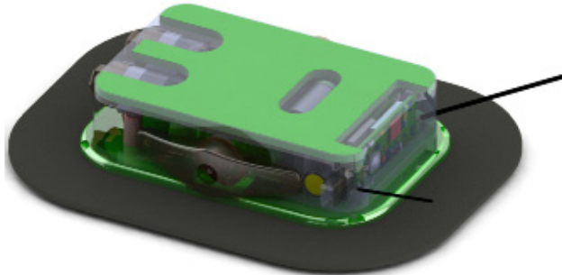
Model: PRD-RP Pre-release