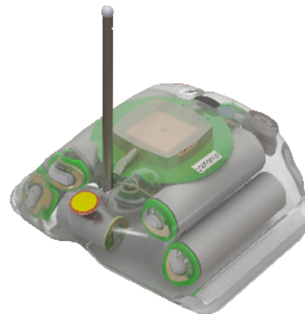
Model: SPLASH10/SPLASH10-BF/ SPLASH10-F-294

tags@wildlifecomputers.com WildlifeComputers.com +1 (425) 881-3048