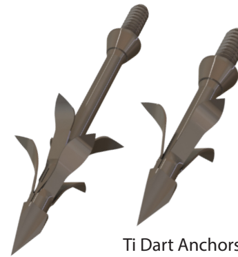
Ti Dart Anchors: 6- and 3-petal

This is a small representation of our available tags. Tag features, colors, and specifications subject to change without notice. Comparative scale is approximate. Tags are not shown to scale. Lifespan estimates rely on programming, battery variability, temperature, power settings, features utilized, etc. © Wildlife Computers. All rights reserved. This is proprietary information and not to be reproduced, copied, or shared without written permission.