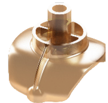
SPLASH10-333 / SPLASH10-F-333 Deployment Cup

LIMPET deployment accessories available for Wildlife Computers LIMPET tags only.