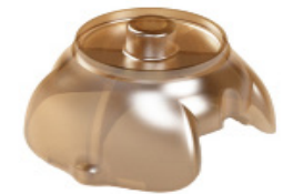
SPLASH10-F-333 Deployment Cup

LIMPET deployment accessories available for Wildlife Computers LIMPET tags only.