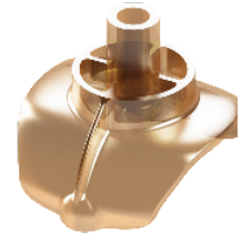
SPLASH10-333 Deployment Cup