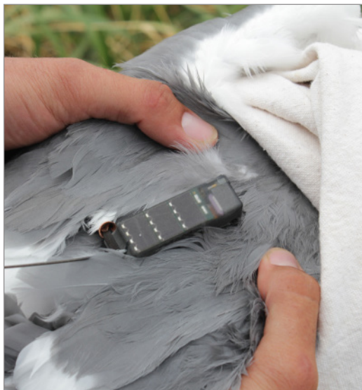
Rainier-S20 on Western Gull in Oregon Federal Bird Banding Permit #05271.

*Available with either harness loops or holes depending on your preference.