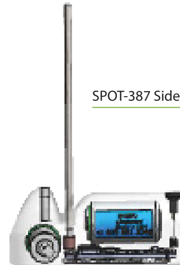
SPOT-387 Side View

tags@wildlifecomputers.com WildlifeComputers.com +1 (425) 881-3048