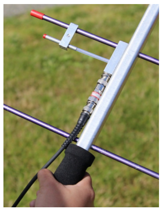
Figure 2: 20 dB External Attenuator